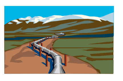
Protection for critical infrastructure