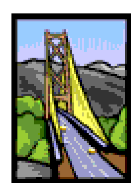
Structural integrity monitoring